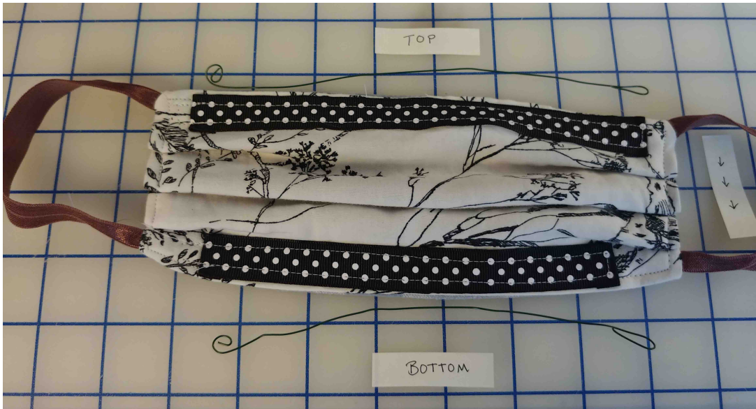
b) Coiled loop